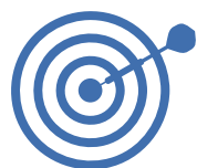
Focusing on your goals

Your approach to investment will vary depending on what you are looking to achieve.